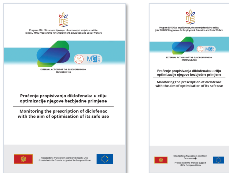
Brochure and Flyer, September 2021

During september 2021, the CInMED project team has been prepared the brochure (A5, 16 page) and flyer (A4, divided on three parts) for workshop that should be held to healthcare professionals in PHC regarding the project and messages/warnings that should be implemented in information system that will appear when prescribing Diclofenac. Both, brochure and flyer, has been approved from CFCU regarding visibility elements and both has been published in amount of 100 pieces and distributed to PHC centers as the second workshop has been organized on-line due to pandemic.