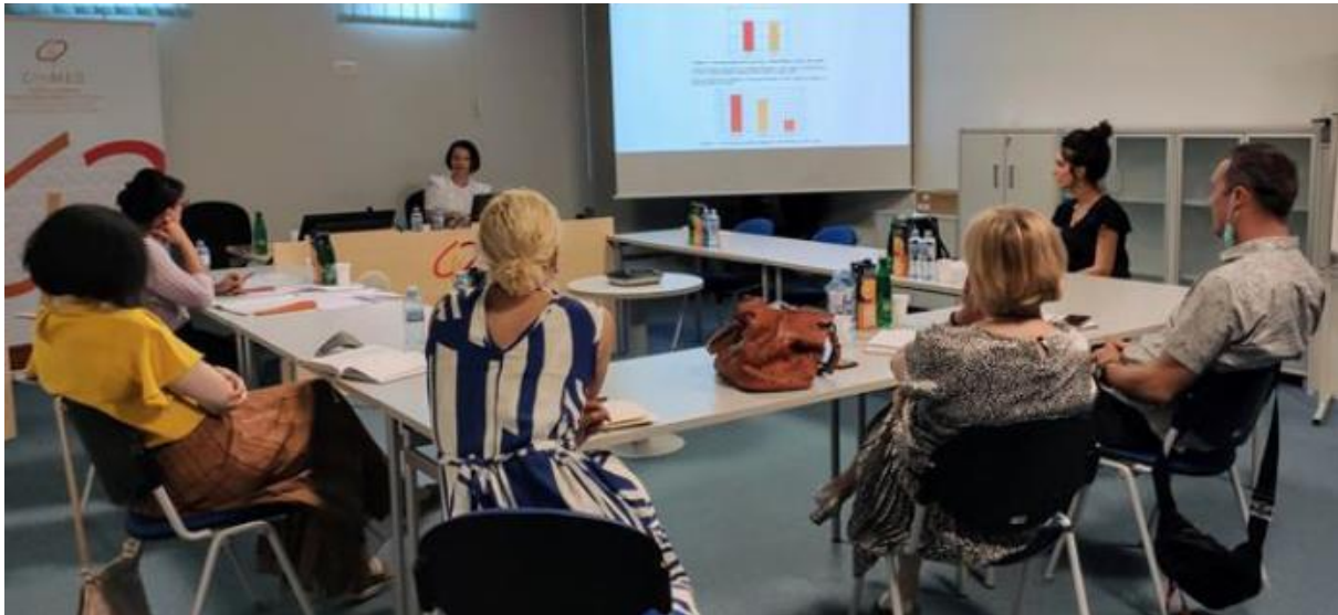
Presentation of project to the representatives of Ministry of Health (MoH) and Health Insurance Fund (HIF)

Participants were introduced to the project from the aspect of organization, resources and the team that implements it as the project's basic assumptions and project goals. It was also pointed out the role of MoH and HIF in the further implementation of the project relates to the acceptance of the recommendations of the research team and the implementation of these recommendations in primary health care (PHC) information system trough messages/warnings to physicians that will appear when prescribing Diclofenac.