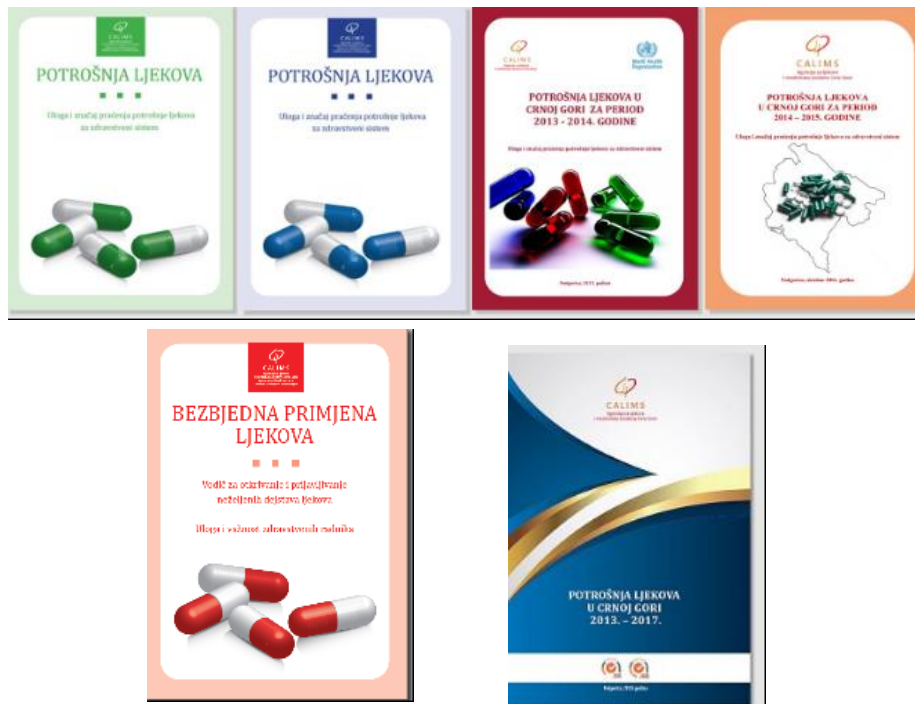
Figure 2 CInMED Publications

contains numerous publications in the field of pharmacovigilance and drug consumption of importance to the professional and general public in Montenegro.