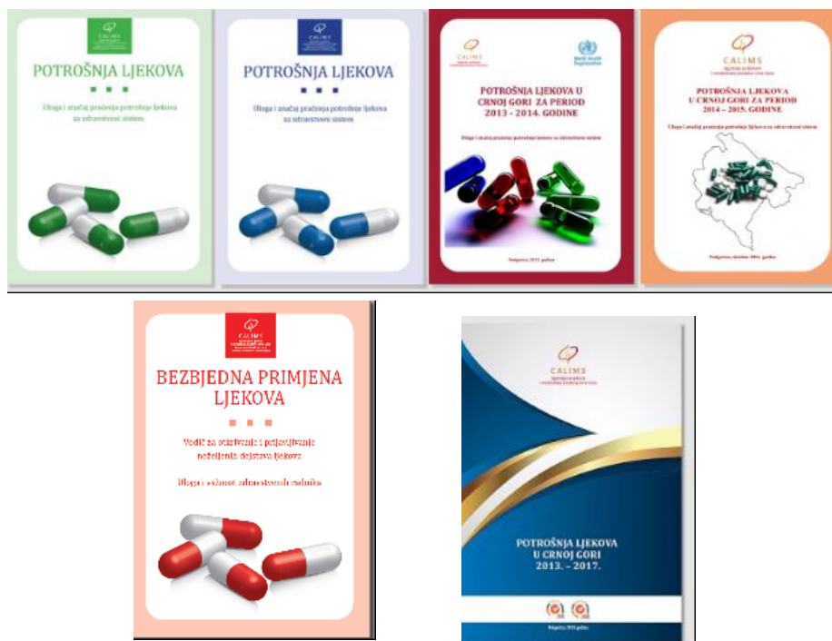
Figure 2 CInMED Publications

CInMED is a regulatory as well as a scientific research and innovation organization. The manufacturing and marketing of medicines is an activity of public interest and medicines must meet the highest standards in terms of quality, safety and efficiency, all in order to preserve the health of the individual and public health. The competence of CInMED of special importance for public health refers to pharmacovigilance, ie. monitoring the safety of medicines use. Modern IT are increasingly used to monitor the safety of medicines use. It is this innovative project for CInMED that represents the beginning of the use of information technologies in the rational prescribing of medicines. Successful implementation of the project will strengthen the scientific research and innovation capacity of the institution and strengthen the impact of CInMED on the health system in Montenegro. It is to be expected that this will have positive health and economic impacts on the health system in Montenegro. The CInMED website ( www.cinmed.me ) contains numerous publications in the field of pharmacovigilance and drug consumption of importance to the professional and general public in Montenegro.